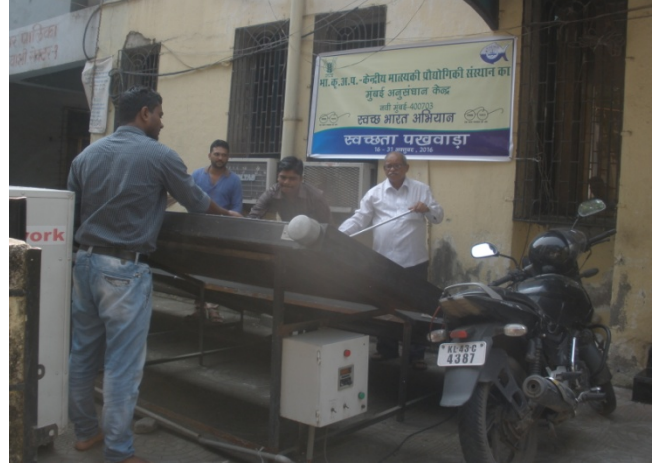
Cleaning in progress in the premises and surroundings of MRC of CIFT