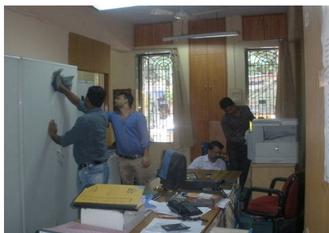
Cleaning campaign in the MRC of CIFT