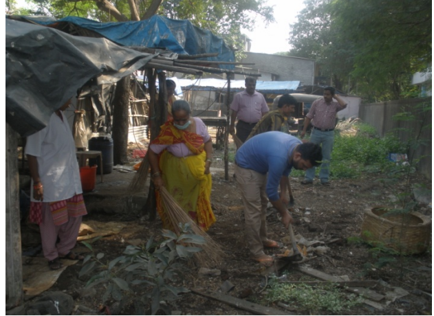
Activities by MRC of CIFT during cleaning campaign at Vashi Fish Market