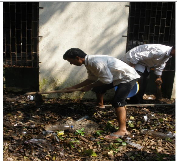
Cleaning in progress in the premises and surroundings of MRC of CIFT